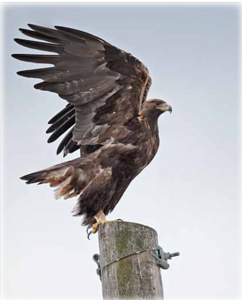
Kate Davis photo of wild Golden Eagle ©

The next metal sculpture will be a big Peregrine, standing on some driftwood. Or a root wad. HA!