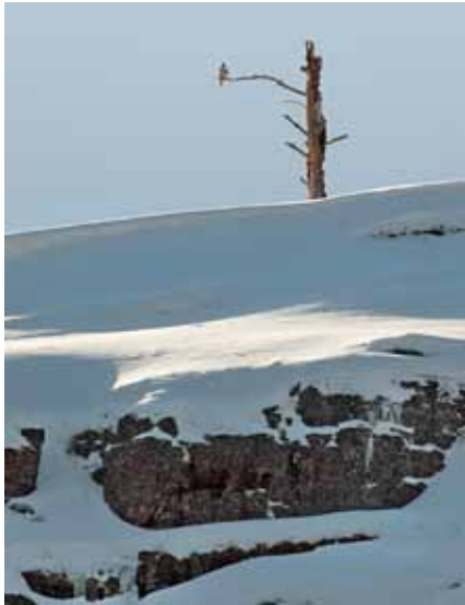
Feb. 28th, and our first Peregrines, looking out of place with a huge snow drift.