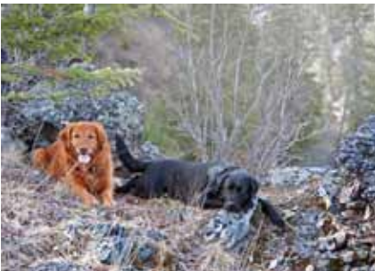
Peanut and Mookie are waiting patiently for me to put the scope away and head down the hill.