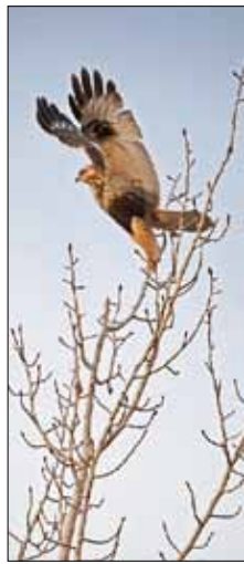
Rough-legged Hawks are out here, heading back north to the tundra.