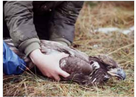
Glacier National Park, November 24, 1986 and the freshly trapped young Bald Eagle, 11 pounds.