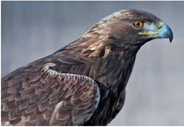
Nigel the Golden Eagle