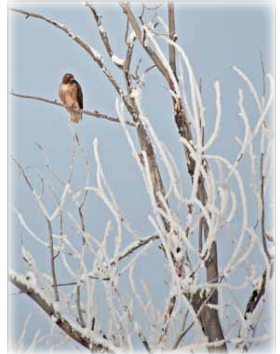
Red-tailed Hawk hunting in the snow.